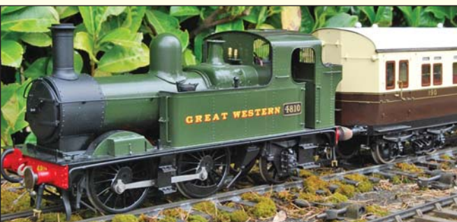
3) Finescale GWR 48xx 0-4-2 Tank and Autocoach. Beautiful models from Finescale Locomotive Company. Fully detailed and painted to a very high standard. Exceptional quality, mint condition. Sold as a set..... £2150.00