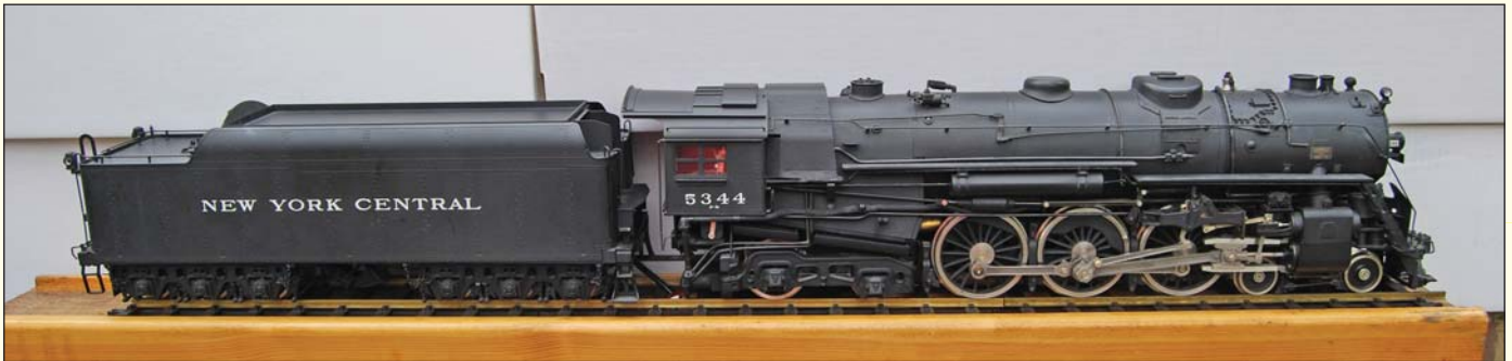
2) Aster NYC Hudson. Fully functioning with operating lights etc. In near mint condition - a little dusty. A beautiful model and highly collectable..... £2750.00